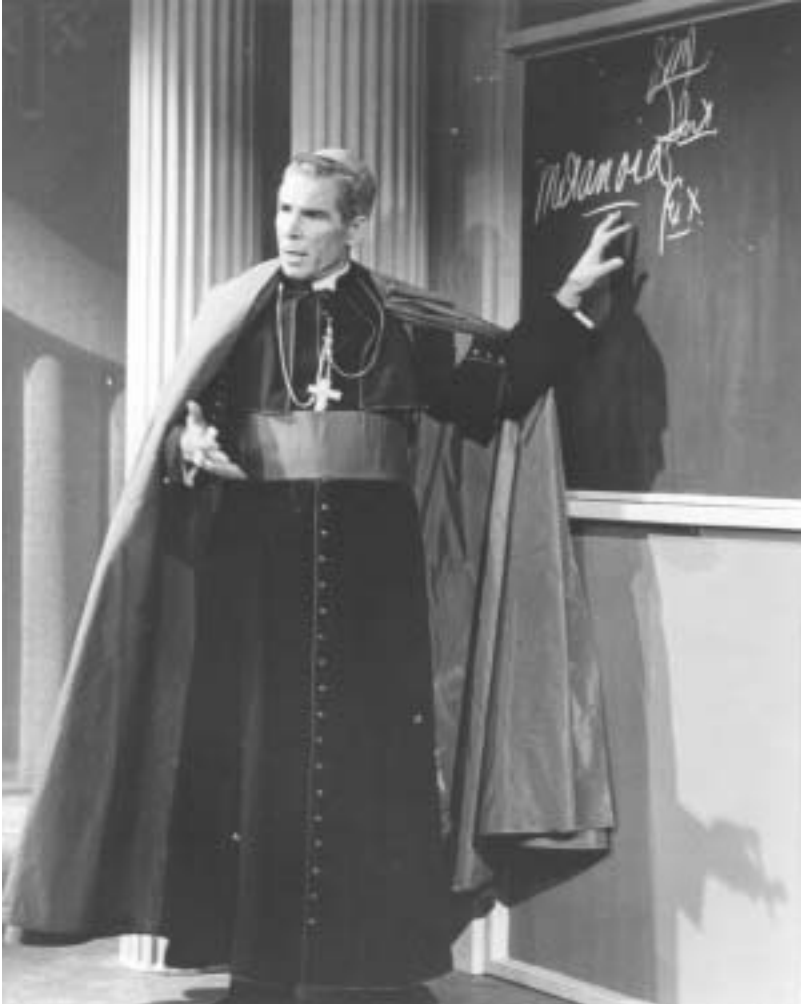
Sheen at blackboard during "Life Is Worth Living" television show.