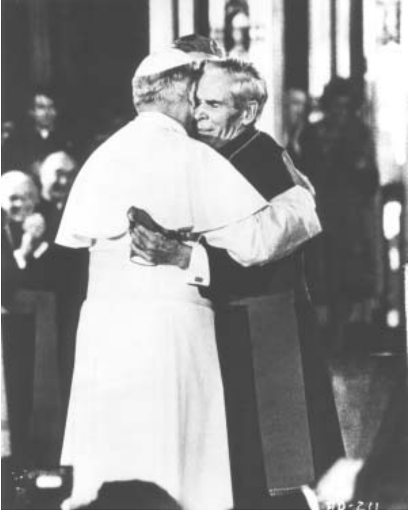
Fulton hugged by Pope John Paul II, 1978.